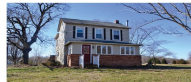
3 BR/2 BA BRICK HOME & OUTBUILDINGS ON 14.5+/- ACRES ACROSS FROM NI RIVER RESERVOIR 10507 Gordon Rd., Spotsylvania, VA 22553**