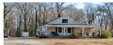
3 BR/2 BA HOME ON 6+/- ACRES ON Rt. 208 9937 Courthouse Rd., Spotsylvania, VA 22553