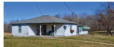
2 BR BUNGALOW, OUTBUILDINGS & POND ON 15.9+/- ACRES ACROSS FROM NI RIVER RESERVOIR 10509 Gordon Rd., Spotsylvania, VA 22553** **Offered individually and together